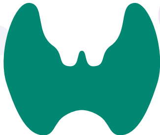
Assess Treatments for Thyroid Disorders